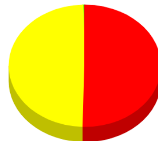
Evolution of the Editorial Work